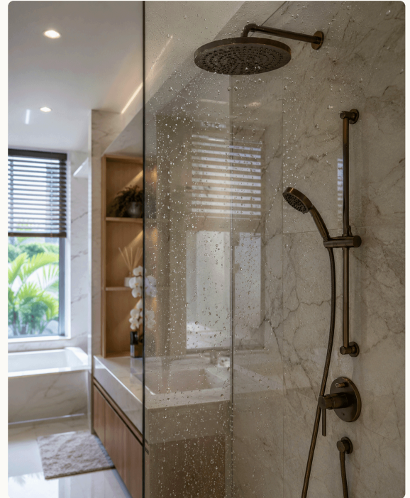
DONE WEEKLY → GLASS STAYS THIS CLEAR FOR YEARS.

Need a real glass cleaner , not bathroom cleaner. Works: Hagerty Mr Glass (RM 28 Shopee), Cif Glass & Multi (RM 12 Tesco), Goodmaid 3+1 (RM 8 AEON). Avoid: anything with "limescale remover" — micro-etches over time.