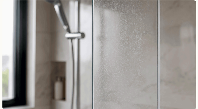
DEEP CLEAN TACKLES WHAT DAILY/WEEKLY MISSES